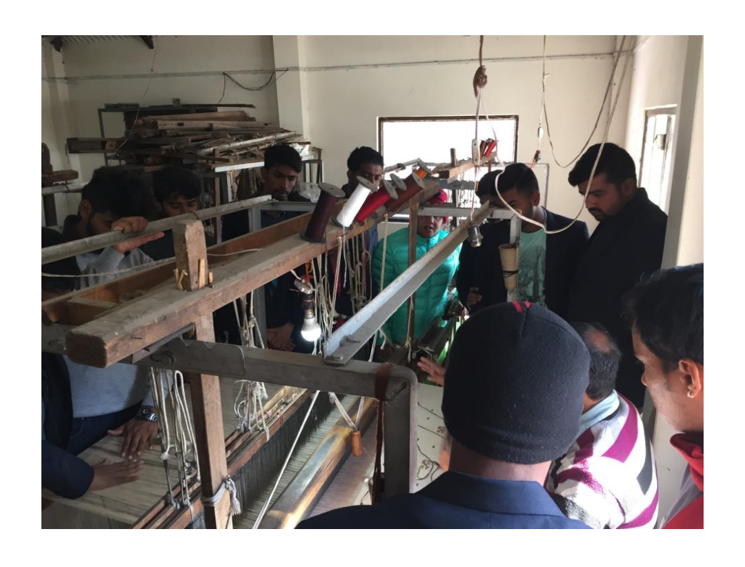
At Manali, Himachal Pradesh