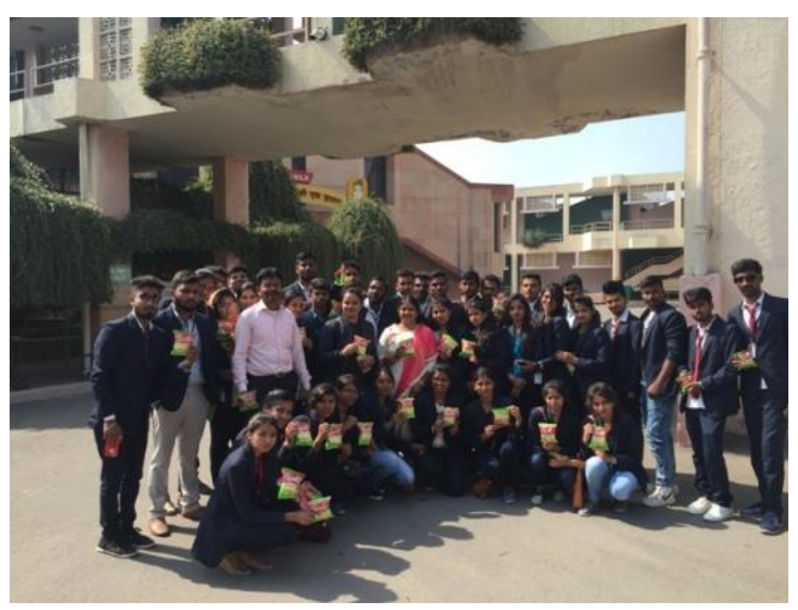
Parliament House, New Delhi

As part of Industry Academia interaction students were taken on and Excursion and Industry visit to Parle Company, Delhi, Parliament House, and kulu manali.